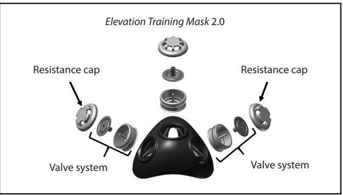
Figure 1. Elevation Training Mask 2.0 resistance caps and valve system

muscle training (RMT)<sup>14</sup> although the use of the ETM during a highintensity training programme lasting several weeks has been shown not to increase lung function<sup>7,12,13</sup>. Therefore, although the physiological changes associated with the ETM are not induced<sup>7,11-13</sup>, improvements have been reported on specific performance markers when compared with identical training without the EMT<sup>7,12,13</sup>.