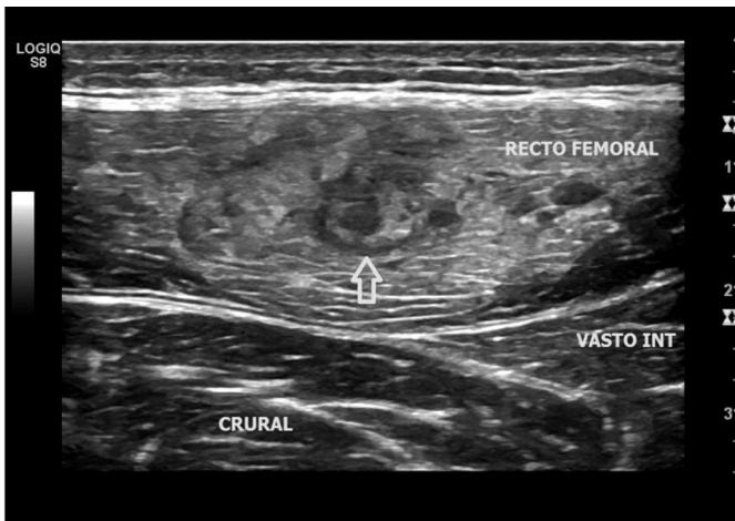
Figure 3. Fractured fibula of the straight femoral muscle. An examination of the short axis of this muscle shows a heteroechoic image (arrow) that blots out the intra-muscular wall, characteristic of a muscle tear with septum rupture.