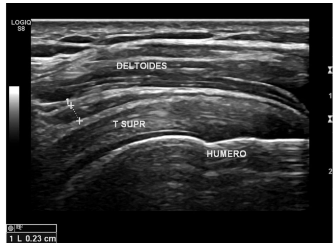
Figure 1. Subacromial bursitis. A long axis examination of the supraspinatus tendon shows that, above it, the bursa has a thickness of more than 2 mm.

formation and repair of the articular cartilage, particularly when used at high dose levels. The primary objective of most articular infiltrations is to remove the pain, thereby improving the joint function.